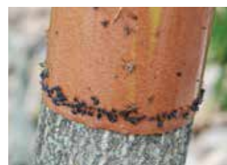
Figure 4. A banded tree with SLF nymphs stuck at the bottom.

Any tree can be banded, but we recommend specifically banding tree-of-heaven, the preferred host, or trees where you see a lot of egg masses or nymphs (Figure 4). Special tape for this purpose can be purchased, though duct tape wrapped backward and tight to the tree also works well. Push pins can be used to secure the band. Adult SLF will avoid tape, so it is essential to band trees in the spring when there are nymphs. Be advised that birds and small mammals stuck to the tape, while rare, have been reported. Check and change traps every other week.