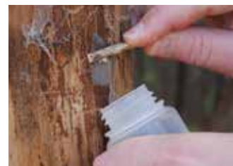
Figure 3. Scraping SLF egg masses from a tree.

This is the most effective way to kill the eggs, but they can also be smashed or burned. Remember that some eggs will be laid at the tops of trees and may not be possible to reach.